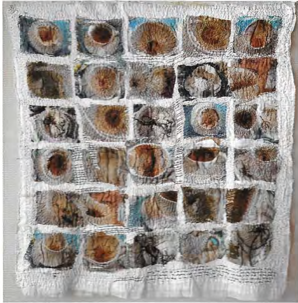
Community of Cups , Mixed Media, 2010.

archived piece such as a sewn fabric or one that is emerging from a tea cup and a couple of tables displaying an assortment of objects – tea cups made of glass and china, kettles, beads and stitching supplies.