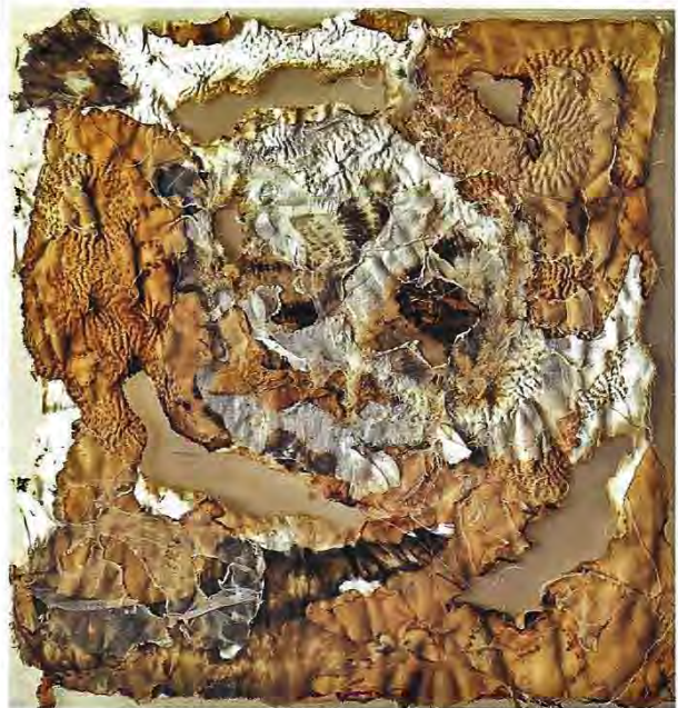
Fragments of the Whole , Cotton Voile, Nylon Net, Silk, Cotton-Polyester Thread, 14 x 15 inches, 2013.

Inside the gallery, a variety of framed and embroidered pieces of fabric – frazzled, knotted, cleaved – repetitive motifs of running and cross- stitches occupy the walls. The floor is thwarted arbitrarily by glass vitrines each containing an