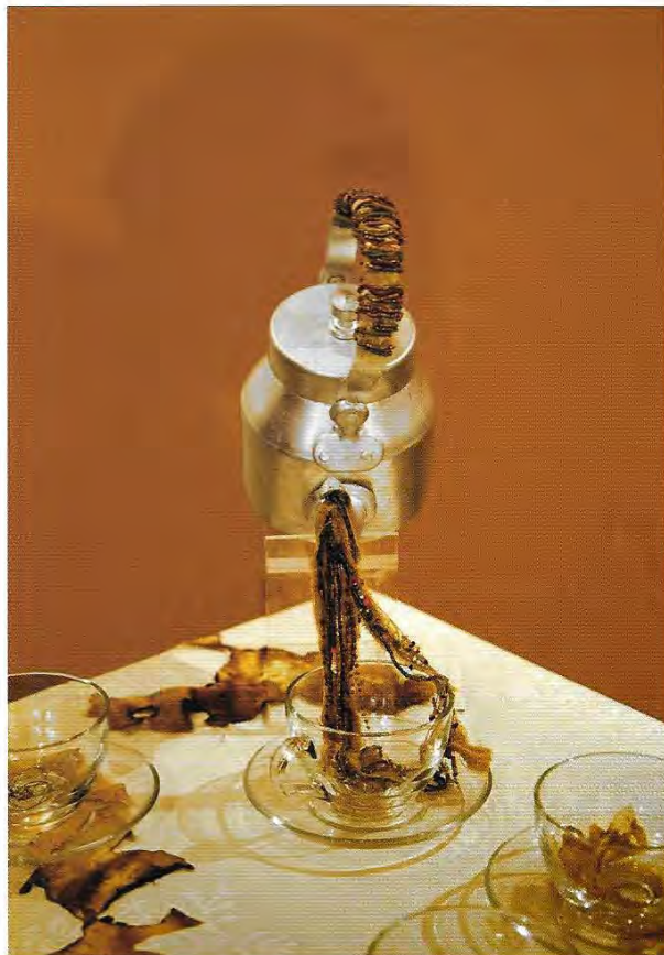
The Stain Tea Party , Site-Specific Installation, 2015.