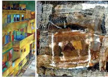
Insight by Kathryn Myers. | Mapping Mindstains by Gopika Nath.

These days, it's only in bureaucratic circles that you come across the term "cultural exchange". What it usually signifies is a transaction between two countries, or cities, in which the only acceptable currency is the cultural cliché: India sending out folk dancers to Japan, for instance, and getting in return