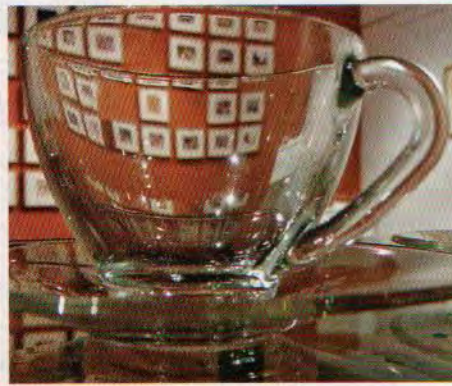
(Clockwise) Work in view: Self Doubt; Foreground - Patterns of Transformation; and The Universe in My Tea Cup (set of 30 works)